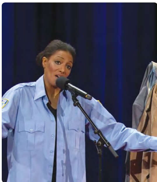
Sarah Jones changes personas with the simplest of wardrobe swaps at 2014 TED Talk.

Sarah Jones started researching for Sell/Buy/Date in 2012. Donald Trump was a character in one of the early drafts of the piece, but Jones took him out in 2014. "I just didn't want to dignify him with a presence in the theatre," she said. "I'd say he overshot the theatre world quite a bit and unfortunately now he's writ large all over our history as a country."