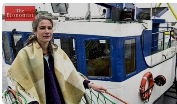
Abortion at Sea (Economist Films, 2017).