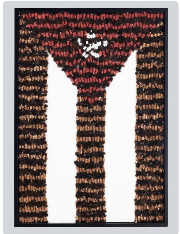
Tania Bruguera, Estadística , 1996, woven human hair and cloth laid on cardboard

L.A.-based performance artist Kristina Wong has actively explored the relationships between political action and art, becoming an actual elected representative on the Koreatown neighborhood council and exploring in a performance piece about it questions such as: Is she more effective as a performance artist or a politician? Can she abolish ICE? Is there actually a difference between performance art and politics?