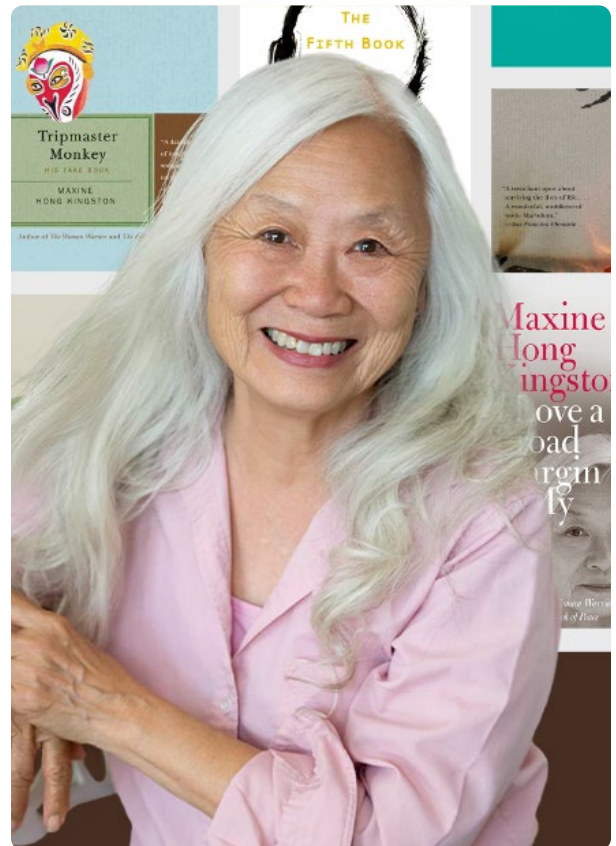
11/13/23: An Evening with Maxine Hong Kingston

As defined by: SisterSong: Women of Color Reproductive Justice Collective, National Latina Institute for Reproductive Justice, Asian Communities for Reproductive Justice