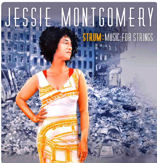
Cover Art: Ofi Carino