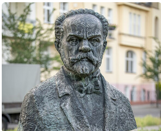
Antonín Leopold Dvořák

When our land is illum’d with Liberty’s smile, If a foe from within strike a blow at her glory, Down, down, with the traitor that dares to defile The flag of her stars and the page of her story! By the millions unchain’d who our birthright have gained We will keep her bright blazon forever unstained! And the Star-Spangled Banner in triumph shall wave While the land of the free is the home of the brave.