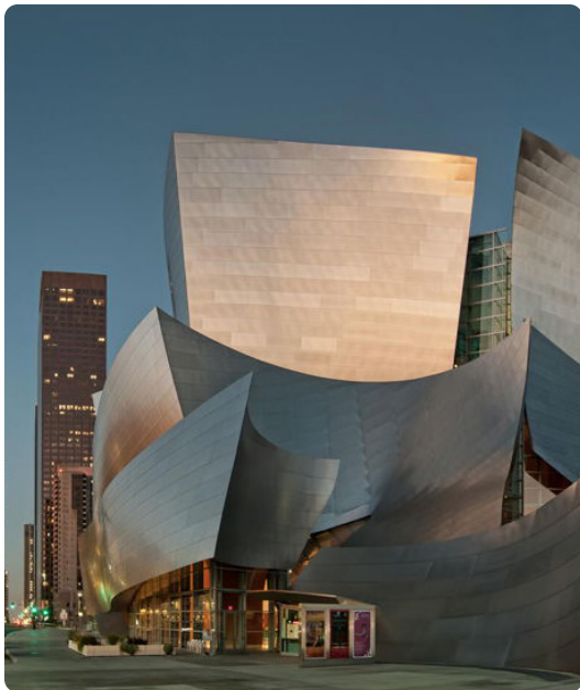
LA Phil | Walt Disney Concert Hall