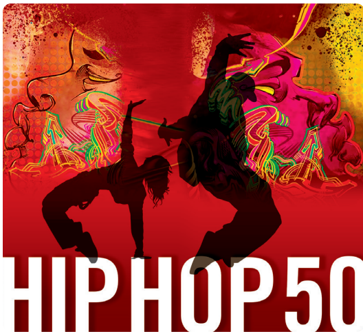
Artwork: Dark Matter in Breaking Cyphers book cover