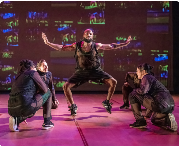
Ephrat Asherie Dance: UNDERScoreD