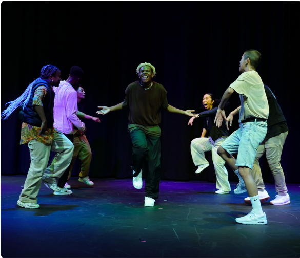
A portion of the theatrical production H.O.P.E. will be featured during the second installment of Hip Hop 50, on September 30.