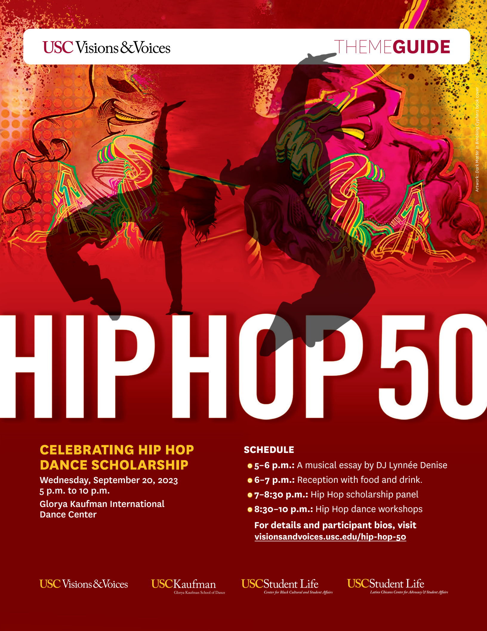
Artwork: Dark Matter in Breathing Cyphers book cover