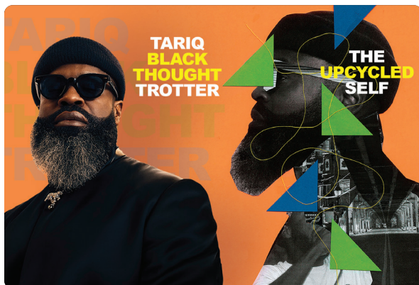
The Upcycled Self: An Evening with Black Thought from The Roots