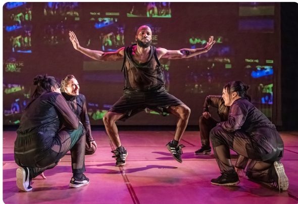
Ephrat Asherie Dance: UNDERScoreD