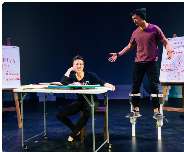
Tales of Clamor