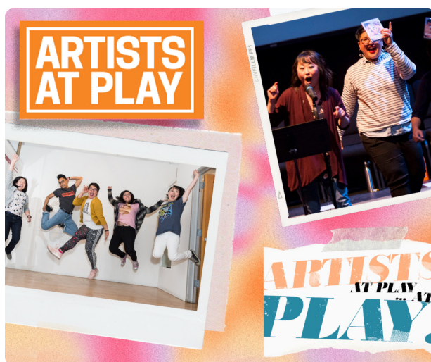
Artists at Play