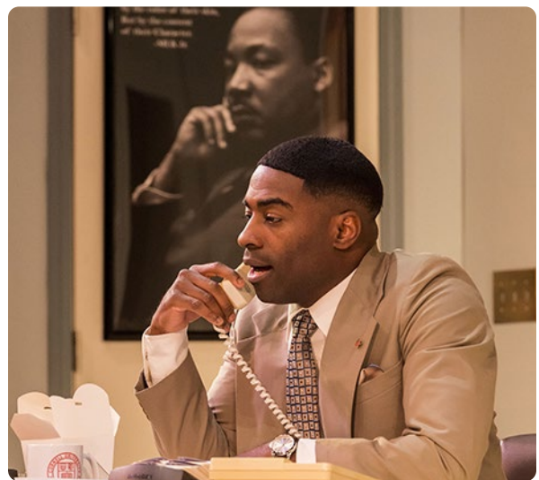
Experience L.A. Event: August Wilson's Radio Golf