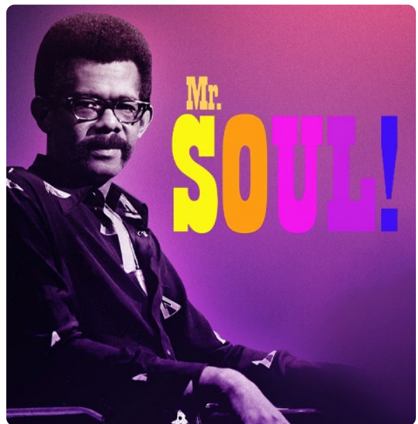
SOUL 2023: Producing to Power in the 21st Century