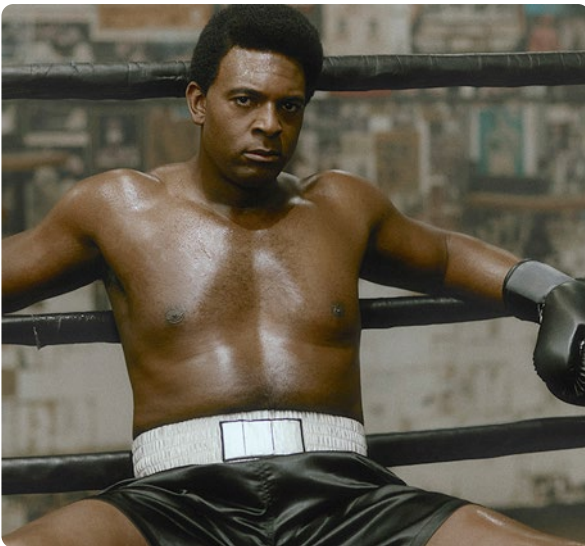
The Met in HD: Terence Blanchard's Champion , April 29, 2023, at 12 p.m., Norris Cinema Theatre