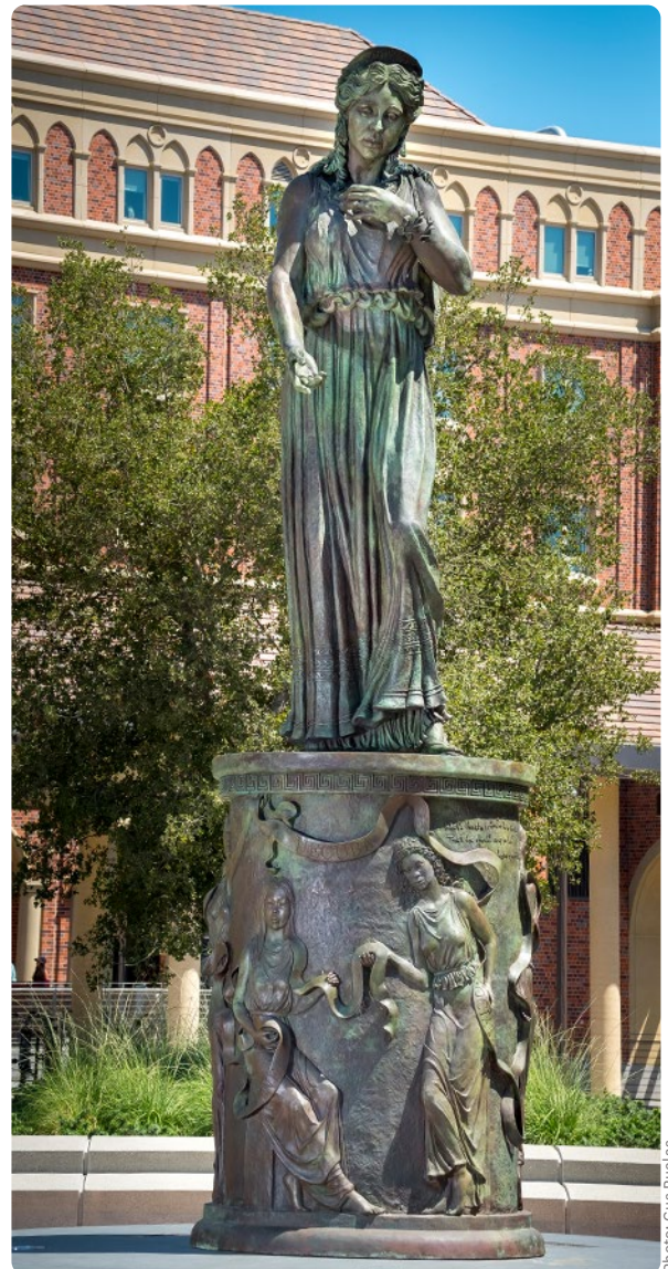
A statue of Hecuba in the USC Village Central Piazza

A pentatonic scale has five notes per octave (compared to the heptatonic scale, which has seven). Pentatonic scales are found in early music in most cultures around the world. The ancient Greek pentatonic scale used in this production is said to have been created by Olympus, an aulos (wind instrument) player who lived in the seventh century BCE. Olympus is also a mythical figure from the Trojan War.