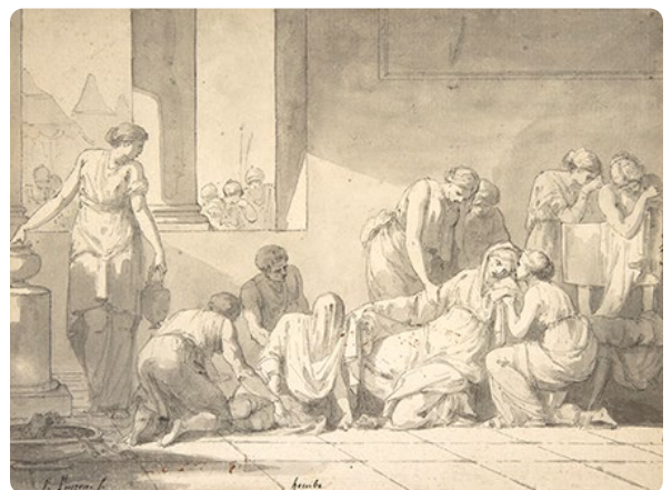
Pierre Peyron, The Despair of Hecuba , drawing, circa 1784