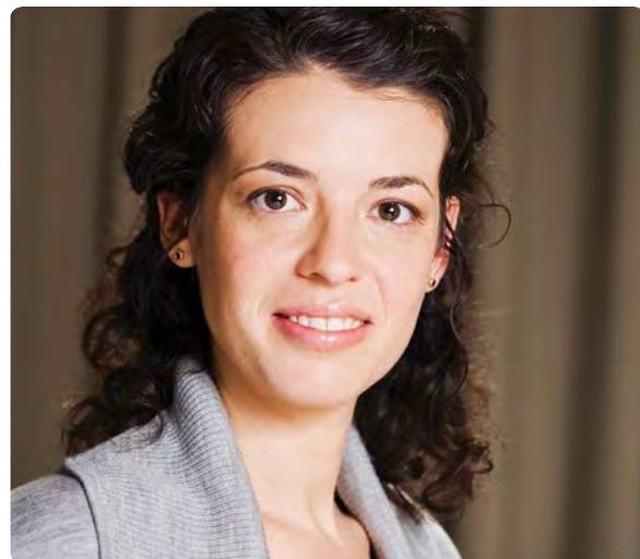
Quiara Alegría Hudes