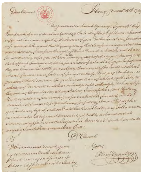
Alexander Hamilton Papers: General Correspondence, 1734-1804; 1734-1772

“The papers of Alexander Hamilton (ca. 1757-1804), first treasury secretary of the United States, consist of his personal and public correspondence, drafts of his writings (although not his Federalist essays), and correspondence among members of the Hamilton and Schuyler families. The collection, consisting of approximately 12,000 items dating from 1708 to 1917.”