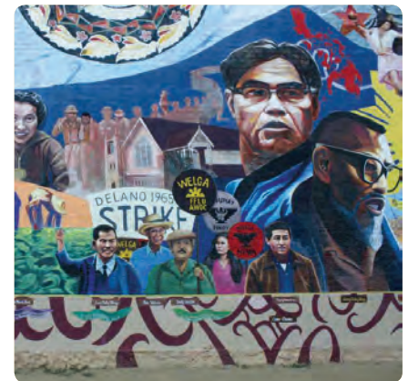
Gintong Pamana Mural