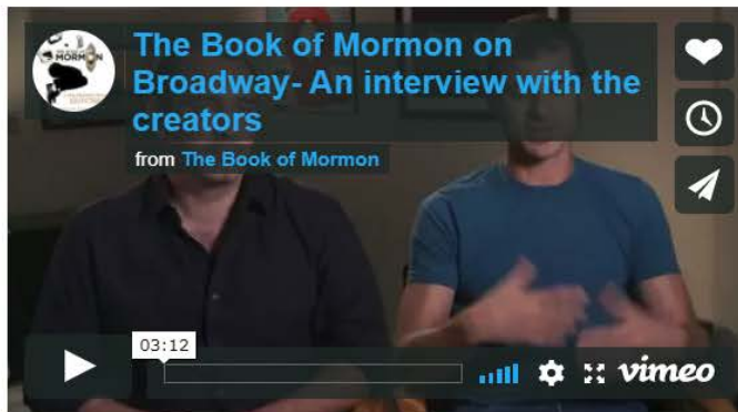
The Book of Mormon on Broadway- An interview with the creators from The Book of Mormon on Vimeo.